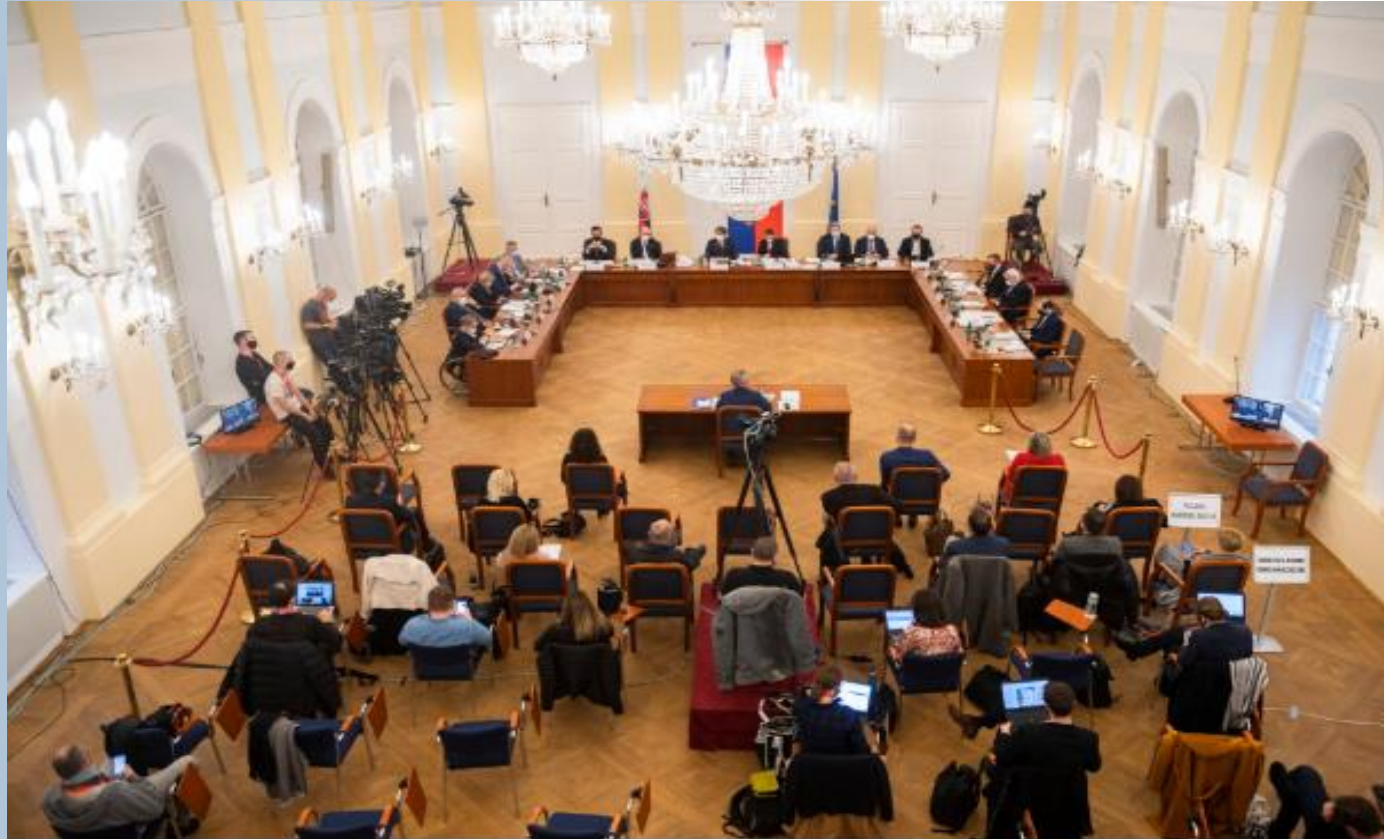
Schôdza Ústavnoprávneho výboru NR SR, ktorý vypočúva kandidátov na generálneho prokurátora SR v historickej budove NR SR na Župnom námestí.