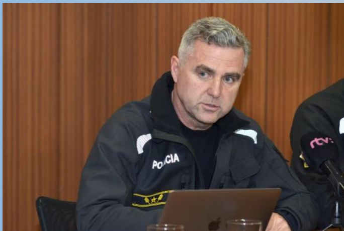
Bývalý policajný prezident Tibor Gašpar.